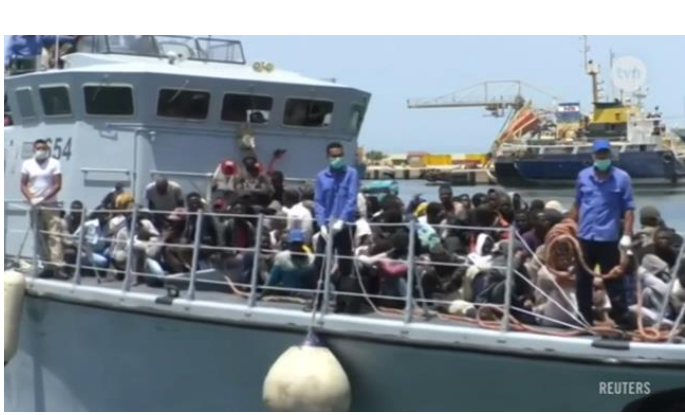
Figure 6 TVN, 2018

In the 2015 period, framing on both TVP and TVN revolved around motives of 'crisis' and 'solidarity'. In the 2018 period, TVN retained emotional language typical for commercial media and the framing appeared to change in line with the course of real events ('crisis' yielded to 'European treatment'). In TVN's report about the infamous Hungarian 'children-kicking camerawoman' from September 9<sup>th</sup> 2015, TVN provided a lengthy description of the woman's political loyalties: "The woman is famous for her relationship with a Hungarian party that she calls right-wing but which has clear national-socialist features"40 and asked a suggestive, if clearly valid, question: "Why is she even called a journalist?". TVN further featured evaluative statements such as "the end of German hospitality", or, "strong speech by the head of the European Commission."41