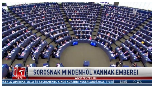
Figure 27 TV2, "Soros has people everywhere'