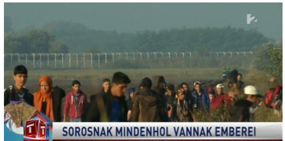
Figure 28 TV2, "Soros has people everywhere"

Hungary". This was the only prominent speech given by George Soros in the summer of 2017.