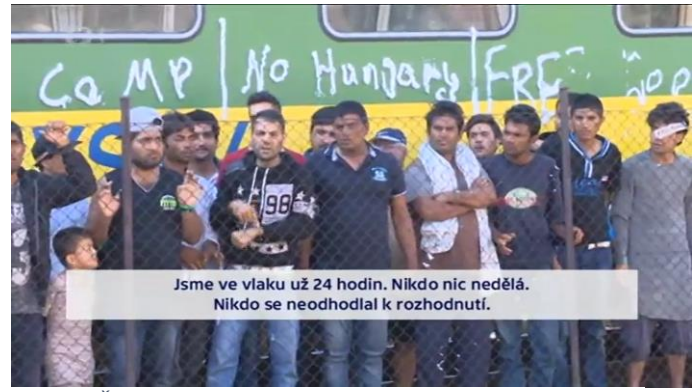
Figure 8 ČT, 4.9.2015, Bicske

On the situation at Bicske train station, ČT used a strong wording without due explanation: "Hungarian authorities lured " refugees in the train by the prospect of "a journey to Austria but then stopped the train next to a refugee camp."<sup>46</sup> ČT's report was accompanied by dramatic imagery of a shouting migrant (see Figure 8). Both ČT and ARD mentioned the "hunger strike" of several men in the train in Bicske. Overall, RTL provided perhaps the most detailed description of the inconveniences